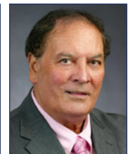
David A. Sousa