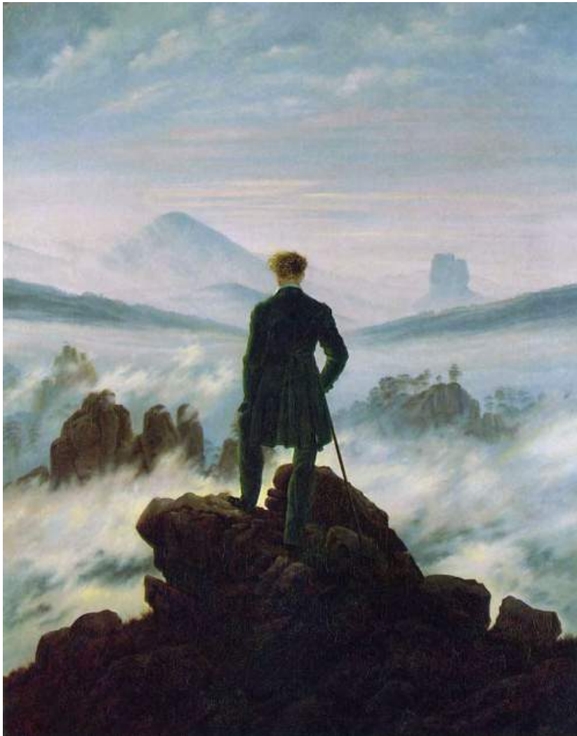
Caspar David Friedrich's Wanderer Above the Sea of Fog (1818)