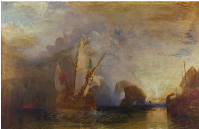
J.M.W. Turner's Ulysses Deriding Polyphemus (1829)

Teacher: Although Romantic art usually has some realistic traits, it doesn't always give an accurate depiction of real life. What are some ways that we romanticize our lives? Can you think of images in our day that do this? Today you will be taking photos of yourself. Just like the first two photos we looked at earlier, one will show a glimpse into reality and the other will show the ideal/romanticized you. It can be exaggerated with your imagination. Consider showing what an ideal day at school would look like or what you aspire to be. Your photo can show how you feel about something versus how it is in reality.