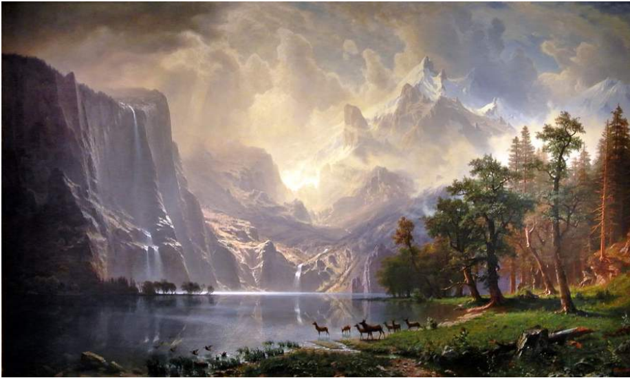
Albert Bierstadt's Among the Sierra Nevada Mountains, California (1868)

Have students compare and contrast the following images.